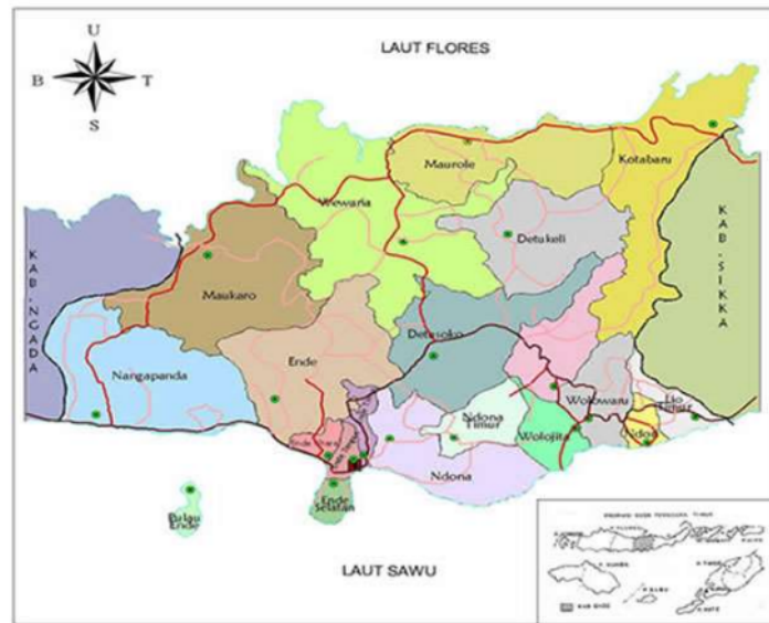
Figure 1.1. Map of Regency of Ende

processes and ultimately they are able to win the competition. In this matter, the accountants should be able to master and introduce the latest technology to give them assistance for this purpose.